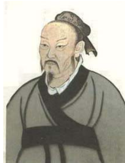
Mencius( human beings are good )