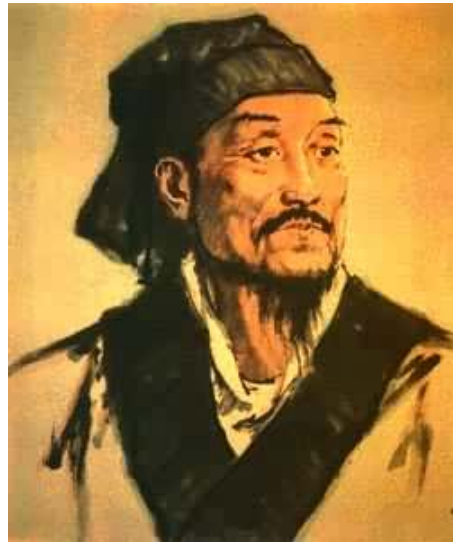
Xun Zi ( human beings are evil )

Eg. Mencius and Xun Zi: the importance of learning